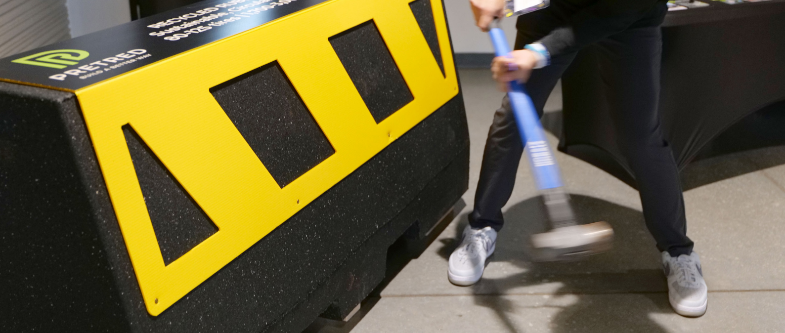
Pretred brought one of their 6' barriers made from over 75 recycled tires, weighing 1,700 lbs. Attendees tested their durability via sledgehammer during the networking reception.