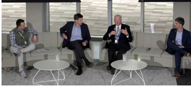
Innovative infrastructure financing panelists called for more creative thinking and flexibility around strategies to fund innovation.