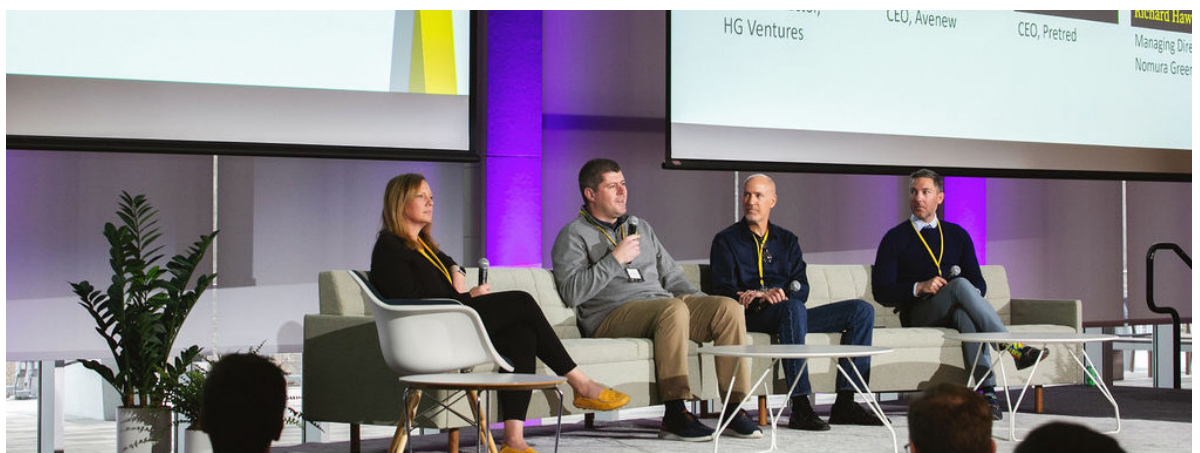
A panel of investors and entrepreneurs highlighted unique approaches to working with startup companies to disrupt the status quo.