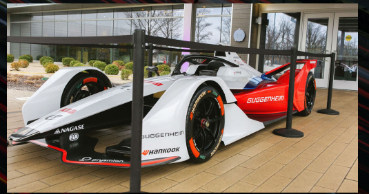
Attendees were greeted by an electric race car from Andretti Global's Formula-E series.